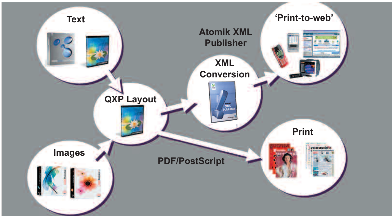
Typical workflow using XML Publisher (exporting XML)

Simply put, at the press of a button Atomik XML Publisher for QuarkXPress allows you to import XML or convert any QuarkXPress 7 file into valid XML; tagged and ready for publication to the web page of your choice. The product is designed for publishers with no prior knowledge of XML. This is fast, no fuss, no scripting, no additional tagging, no cut & paste and 100% accurate - and will save you time, effort and money over managing your XML.